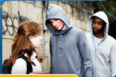
ACTS OF VIOLENCE

Safe Topics: The First 30 Seconds scenarios cover emergency situations such as: